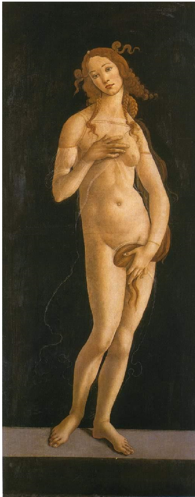
Sandro Botticelli Venus , c. 1484-1490 Tempera on wood panel Turin, Sabauda Gallery, inv. 172