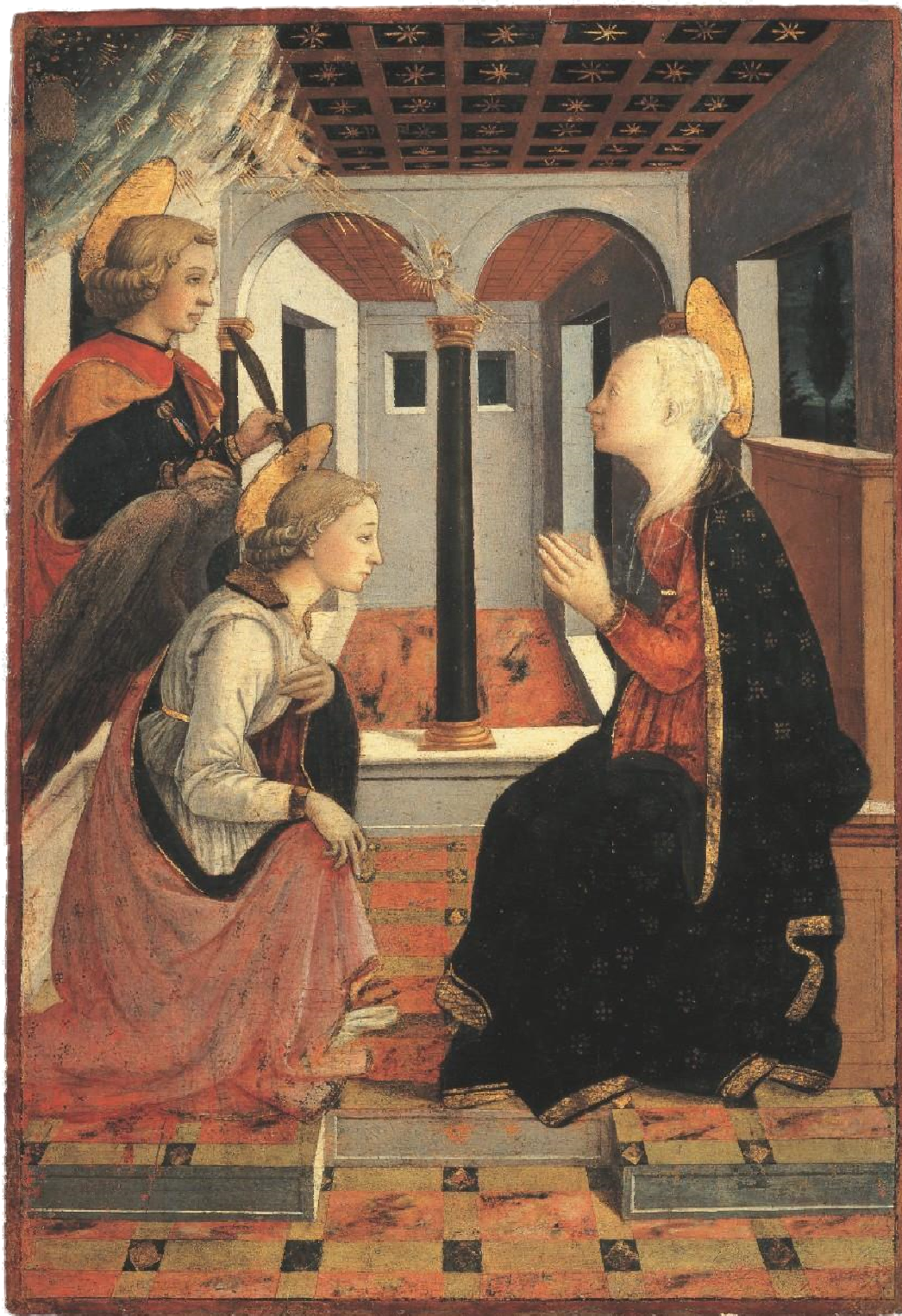
Filippo Lippi and workshop (Botticelli) Annunciation , ca. 1464 Museo di Palazzo Pretorio Piazza del Comune