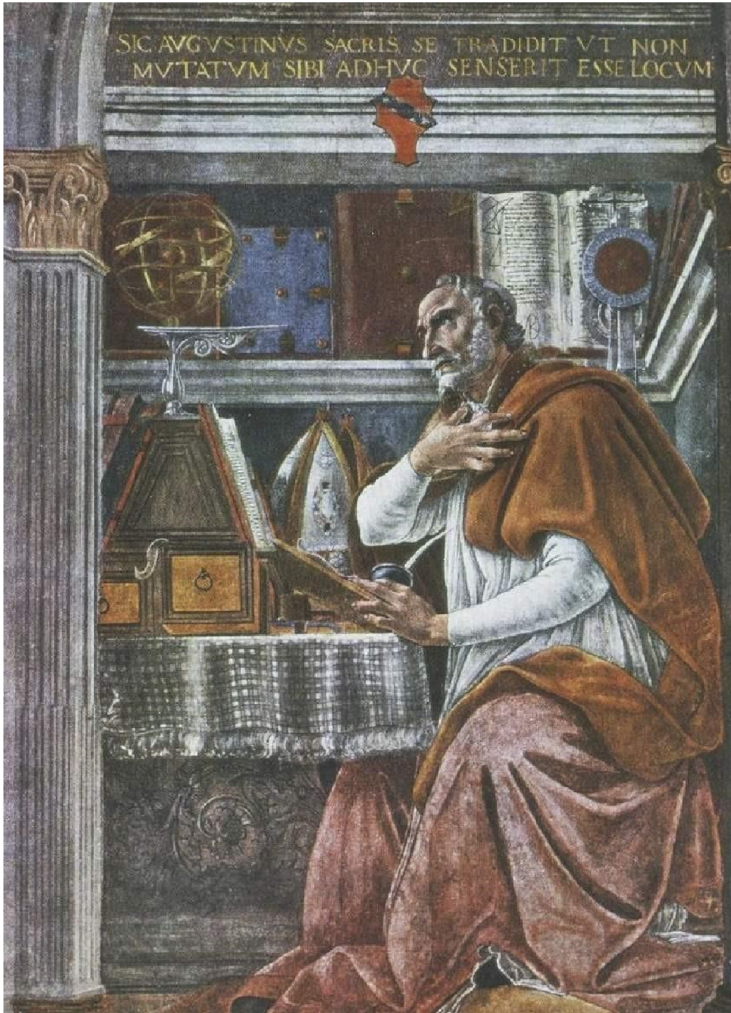
Sandro Botticelli Saint Augustin in his Study , c. 1480 Detached Fresco Florence, Church of All Saints (Ognisanti)