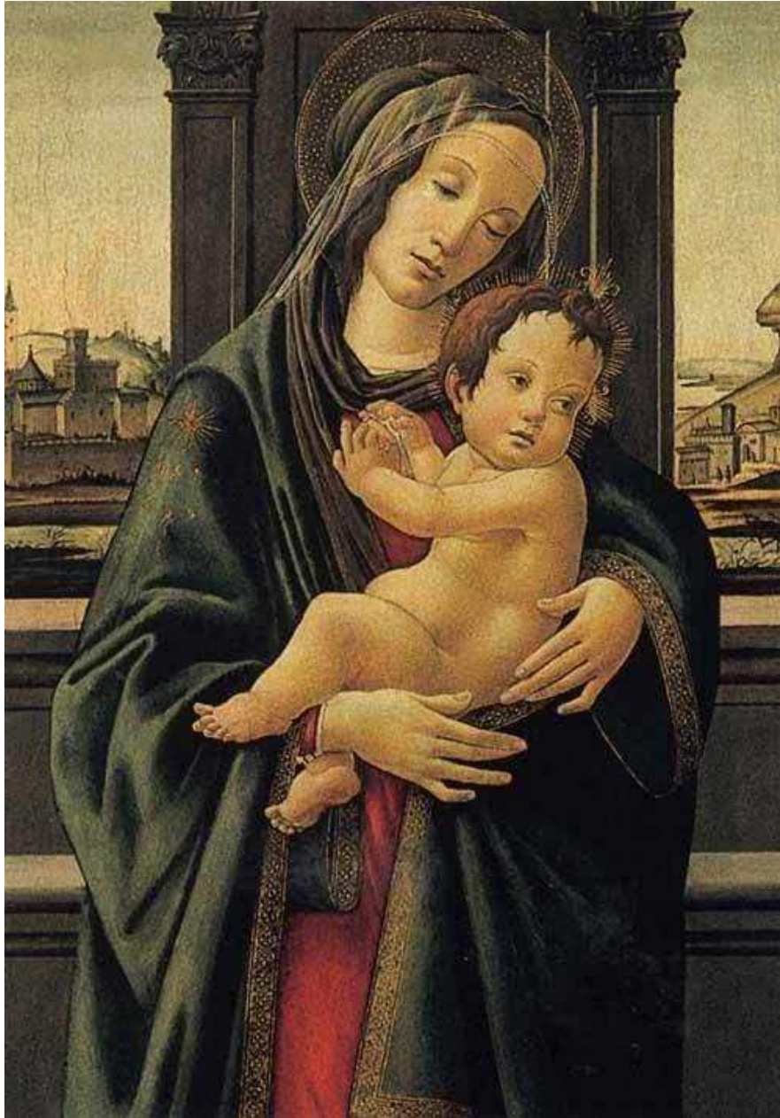
Sandro Botticelli Madonna and Child , 1500 Oil on panel Firenze, Museo Stibbert