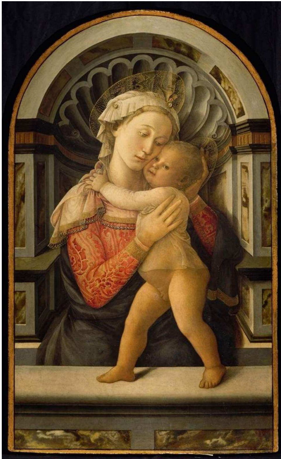
Filippo Lippi Madonna and Child , ca. 1466-1469 Tempera on wood panel Florence, Palazzo Medici Riccardi