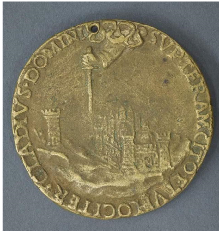
Della Robia Family (15-16 th century) Savonarola Medal Florence, Museo Nazionale del Bargello